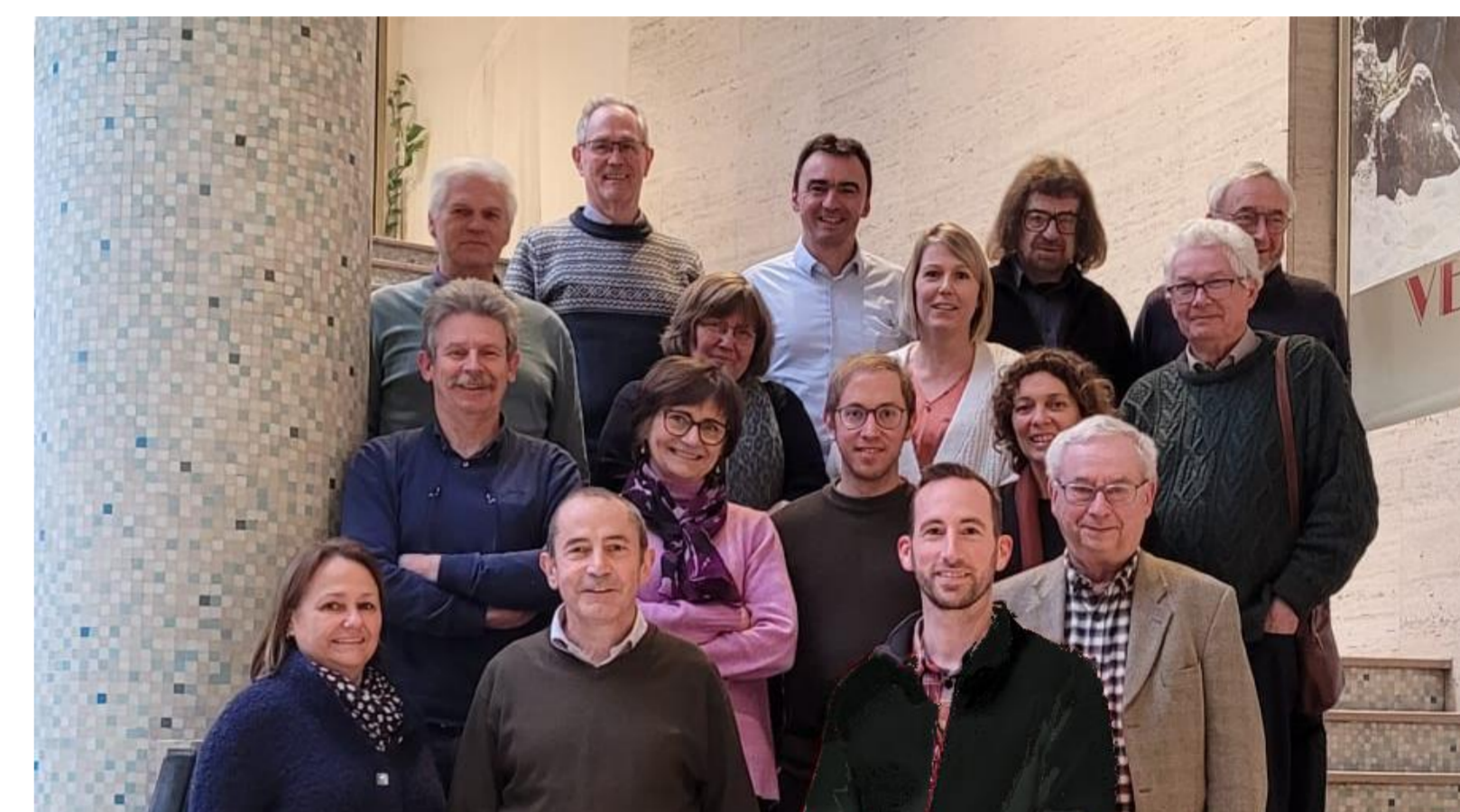
Executive committee 2023 - 2024

Anno 2024 the BVS-ABR counts about 400 members (effective and associate), representing more than 100 organisations in Belgium. Among the members are mainly academics and engineers in various disciplines, such as MD, Radiation Protection Experts, regulators, education and training professionals, safety engineers, medical physics experts, researchers,...